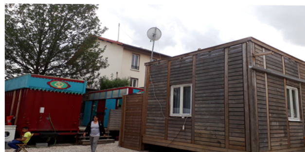
Site of Villensemble project, in Ivry-sur-Seine