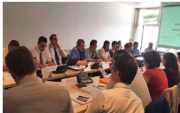
First meeting of the commission

This first meeting was an opportunity to give an