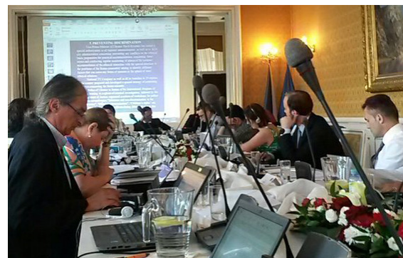
CAHROM meeting in Prague

of Roma populations in general. Several countries, notably Spain, Italy and Great Britain, gave a favourable response to the importance of the transnational outlook on this subject. The next CAHROM meeting will be held in Strasbourg from 24 to 27 October.