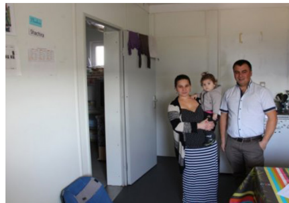
A family in the I2E scheme

> Article on the I2E scheme in Témoignage Chrétien