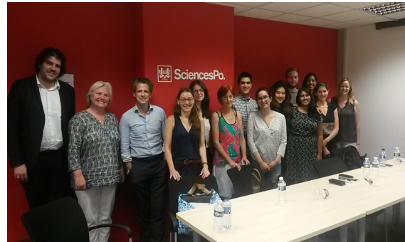
Seminar at Sciences Po with Harvard students

slums and illegal settlements in France as well as to introduce organizations actively working to address this issue.